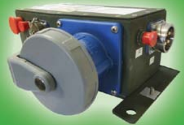
STANDARD POWER MODULE BUILDING BLOCK