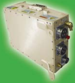
STANDARD POWER MODULE BUILDING BLOCK